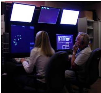
Use of enrouteTrainer at FAA Indianapolis ARTCC

CAASD developed a comprehensive plan that recommended advanced training technology and process enhancements, many of which were included in the FAA's March 2007 Workforce Management Plan. CAASD leveraged advancements in aviation system design, new prototype technologies, and field evaluation data to develop a stand-alone enroute training simulation prototype, known as the MITRE enrouteTrainer . With its high-fidelity, scenario-based instruction, the enrouteTrainer provides students with a realistic environment, simulating the effect of winds, aircraft climb/descent rates, and aberrant conditions. The system's speech recognition and synthesis capabilities simulate pilot/controller interaction, enabling self-paced training, reduced reliance on human resources, and increased standardization. The enrouteTrainer enables the instructor to pause and play back any trainee scenario and it presents an assessment of a student's performance upon instructor request.